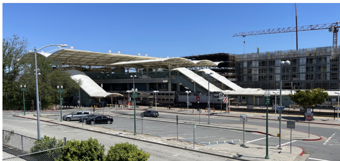
The Millbrae-SFO Station will provide connections from high-speed rail to BART, Caltrain, SamTrans, and other transit providers.

The recirculated document will be available for public review from July 23, 2021 to September 8, 2021.