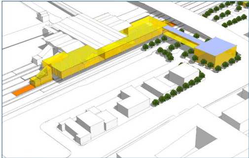
The blue represents location of Station Entrance Hall with overhead pedestrian crossing to connect high-speed rail to Caltrain and BART in the Millbrae Station Design (above) and the RSP Design Variant (below)